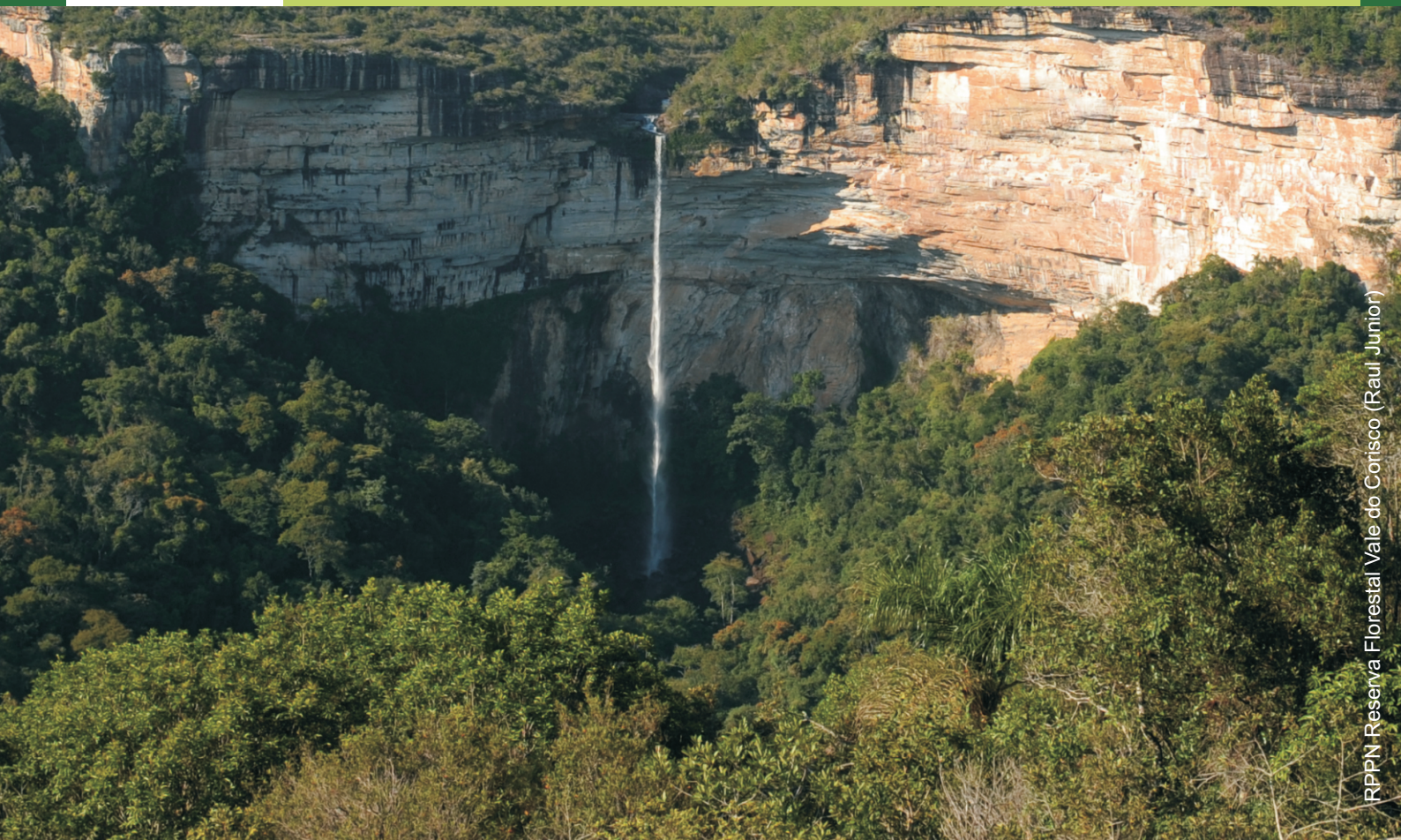
RPPN Reserva Florestal Vale do Cortisco (Raul Junior)